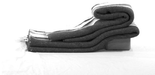
Three Tier Approach (with block)